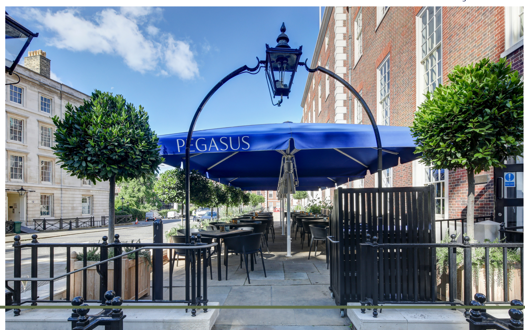
POA - Standing: 50 - Seated: 40

The Pegasus Bar & Restaurant, exclusively available for private hire on Saturdays and Sundays, offers an ideal setting for intimate summer gatherings. Its sun trap terrace overlooking the estate creates a unique and inviting atmosphere for smaller parties. It's the perfect spot for christenings receptions from Temple Church or other local churches, weddings, and other personal celebrations.