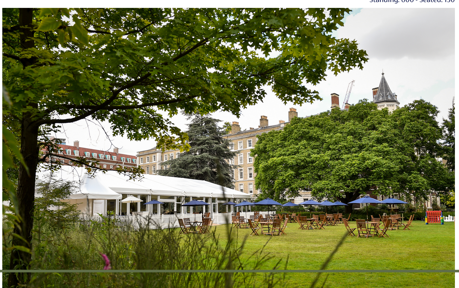
Standing: 600 - Seated: 150

The Inner Temple Marquee, with a spacious 600-person capacity, takes centre stage from mid-June to July, providing a versatile space for both standing and seated events. Surrounded by The Inner Temple Garden, it offers an ideal extension for summer gatherings. Embrace the festivities with garden games, adding a touch of leisure to the expansive marquee space, creating an inviting atmosphere for your events.