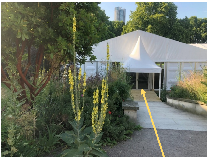
Main Garden Gates